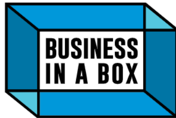
BUSINESS IN A BOX COMBINED OFFICE & STORAGE