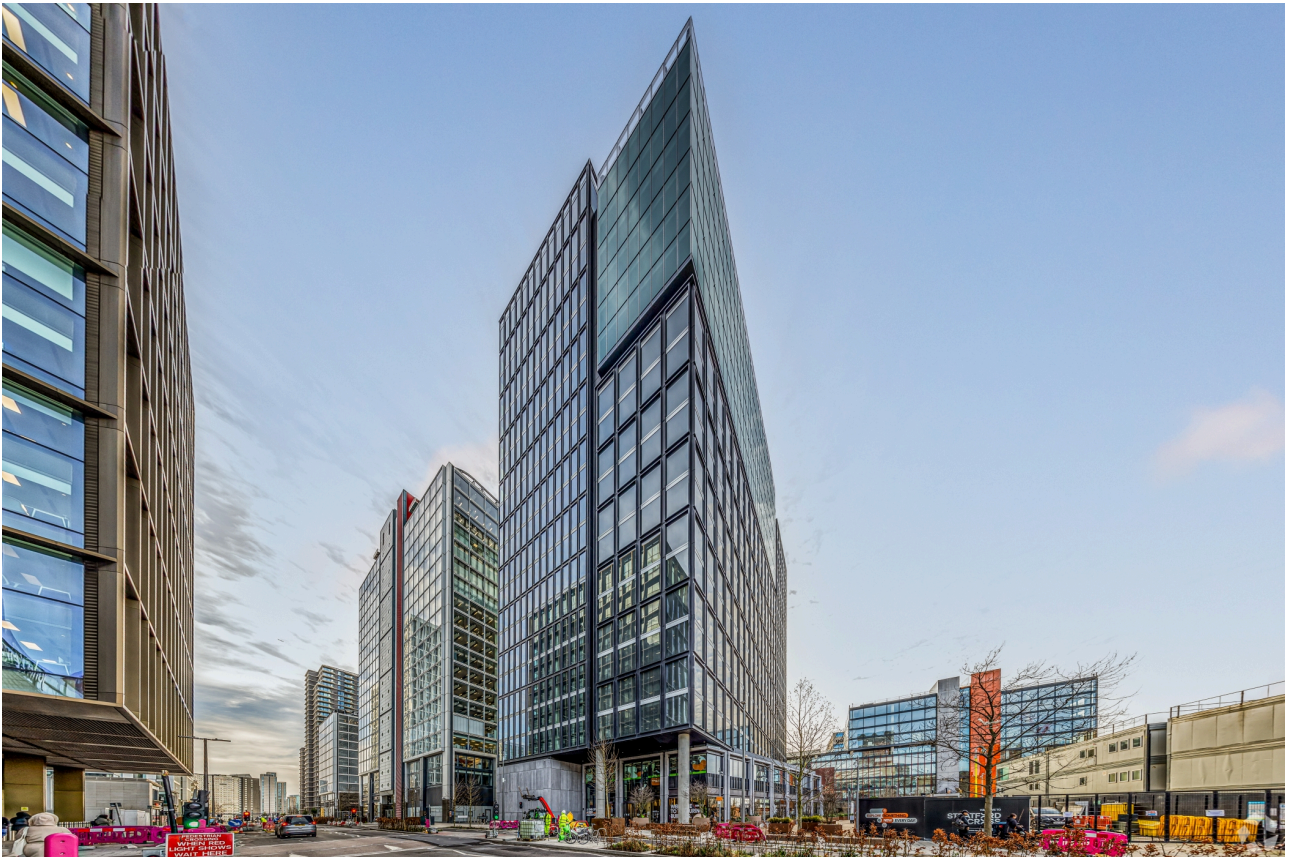
The Turing Building.

Expanding Arden is taking a large slice of 350,000-square-foot building